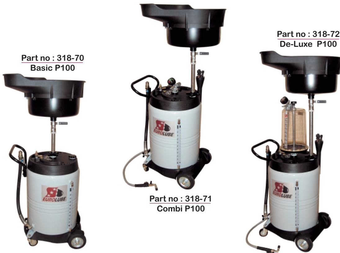
Part no : 318-70 Basic P100